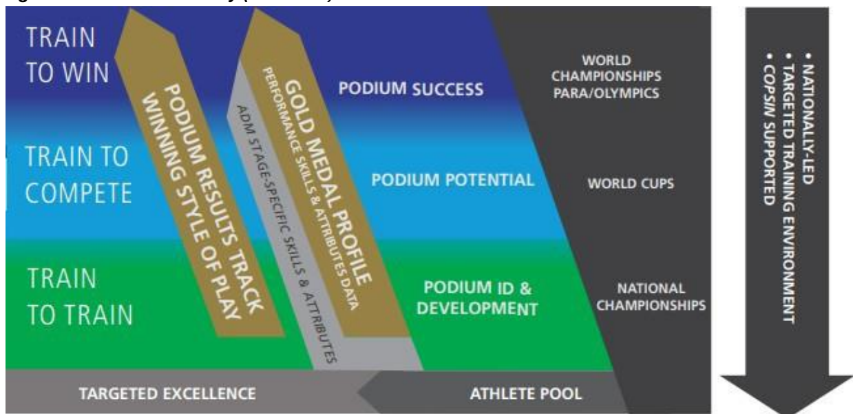
Figure 1 – Podium Pathway (LTAD 3.0)

Canadian Sport Institute / PacificSport athlete and coach support for the Canadian Development and Provincial Development nomination focuses on athletes and teams 5-12 years from the international podium, identified by the sport-specific Podium Pathway (see Figure 1 below) and Gold Medal Profile. These athletes and teams represent both the next generation (5-8 years away) and future generations (9-12 years away) of Olympic and Paralympic (or World Championship) medalists. Support may be focused more toward the future generation (9-12 years away) for some targeted Paralympic sports depending on the quality of the next generation (5-8 years away) of athletes and teams.