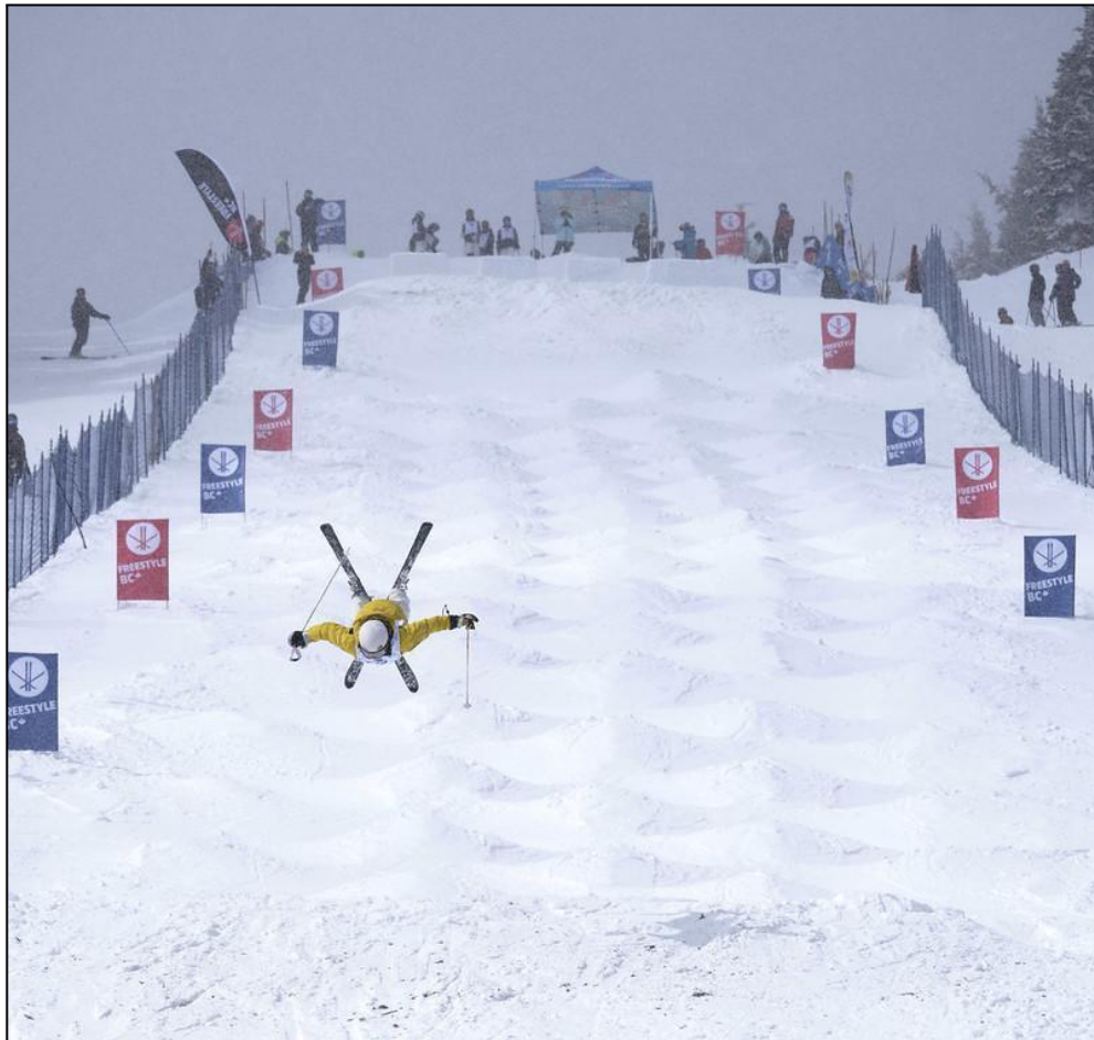
2023 BC Winter Games, Silver Star Mountain Resort, Vernon, BC